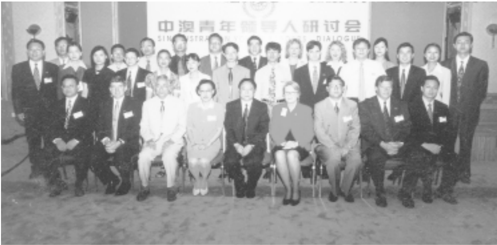
Members of the eighth Australian delegation to China, led by the Hon Judi Moylan MP, with young Chinese leaders at the Sino-Australian Young Leaders Dialogue in Chengdu.

Day five of the visit was spent at E'Mei Mountain, where the delegation met with the Mayor of Leshan Municipal People's Government and the Sichuan Province Federation of Youth. Meishan Province was visited on day six and the delegation met with the Vice-Chairman of the Youth Federation of Meishan Province.