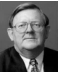
Mr Paul Neville MP , Federal Member for Hinkler and National Party Whip