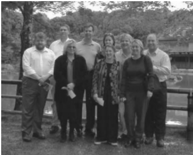
The eighth Australian delegation to Japan, led by Ms Nicola Roxon MP.

'The structural administrative reforms being embarked upon in Japan go part of the way down the road that Australian governments of both major parties, both Commonwealth and State, have successfully trodden over the last decade and a half. The fact that the plans, before implementation, are more modest than the actual achievements in Australia show the enormous cultural obstacles that confront Japanese reformers in this quest' (V. Wallace).