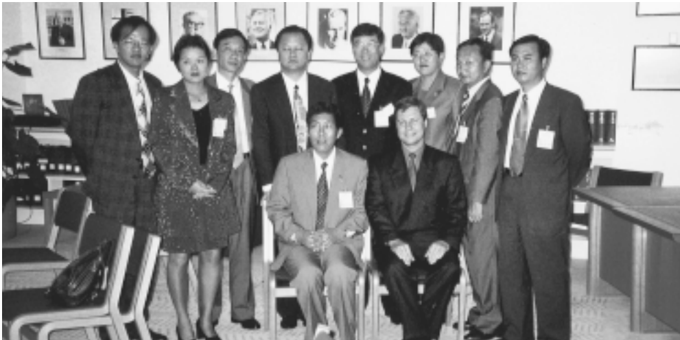
The eighth Chinese delegation to Australia, led by Mr Bayin Chaolu, with Federal Shadow Minister for Education, the Hon Michael Lee MP (leader of delegation to China 1986).

A list of activities organised by the Council for each delegation is available on the Council's website: www.polexchange.org.au