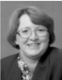
Senator Sue West , Deputy President of the Senate and Senator for New South Wales

Mr Gray is a representative of the Leader of the Opposition, appointed in June 1993.