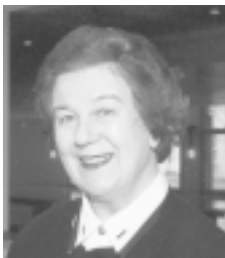
The Hon Dame Margaret Guilfoyle DBE

Dame Margaret was appointed Chairman in August 1996.