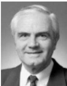
The Hon Alan Cadman MP , Federal Member for Mitchell

Mr Cadman is a representative of the Prime Minister, appointed in December 1981.