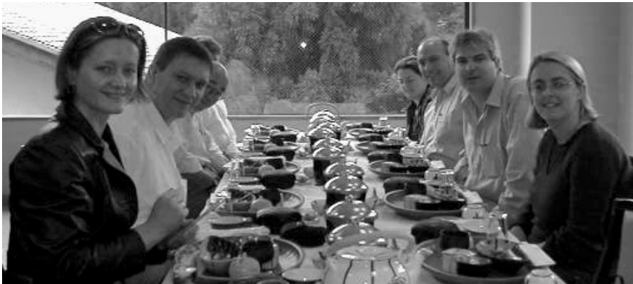
Members of the eighth Australian delegation to Japan, led by Ms Nicola Roxon MP, enjoying a Japanese meal.