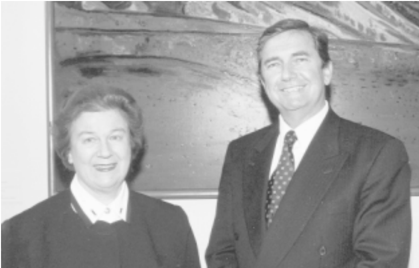
Chairman of the Australian Political Exchange Council, the Hon Dame Margaret Guilfoyle DBE, with the Special Minister of State, Senator the Hon Chris Ellison, who has ministerial responsibility for the political exchange program.